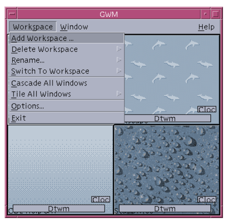
Figure 3–2 Graphical Workspace Manager – Workspace Menu