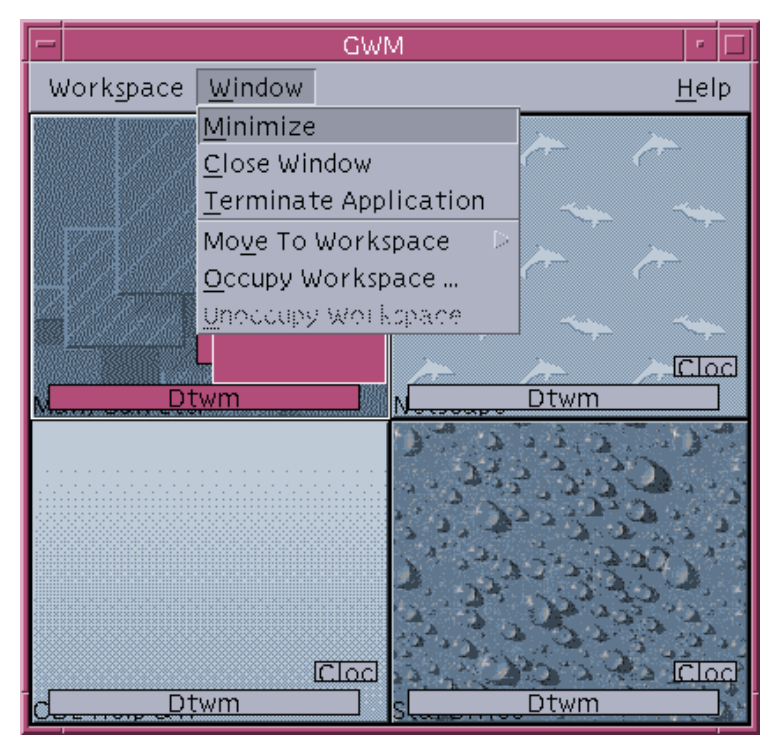
Figure 3-3 Graphical Workspace Manager — Window Menu